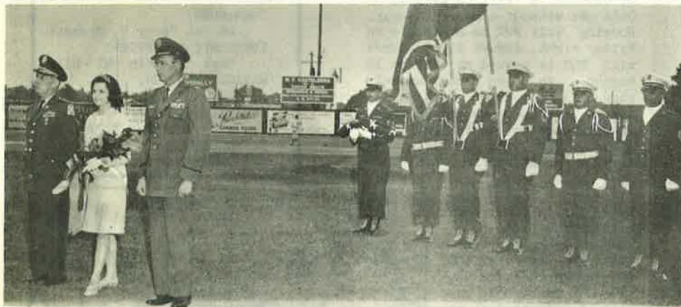
VIRGINIA AIR NATIONAL GUARD NIGHT AT PARKER FIELD