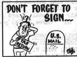
SIGN THOSE TAX RETURNS (An AFNS Editorial)

Federal income tax returns, like wills, contracts and other legal documents, must be signed to be complete.