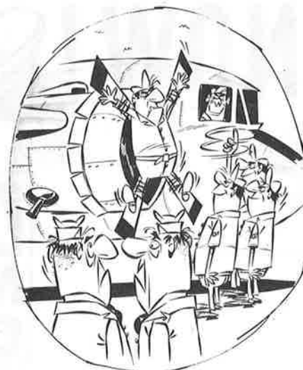
"That crew chief sure has a knack for rubbing his mechanics the wrong way!!"

We invite you to submit articles of interest to the VANGUARD. Is your squadron or section planning a special project? Have you been recognized for a particular job? Contact the Information Office with items of interest to all VaANG Guardsmen. This is your base newspaper, so why not contribute to it's content!