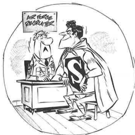
"What did you do in civilian life???"

(Extracted from June 73 issue of The National Guardsman Magazine.)