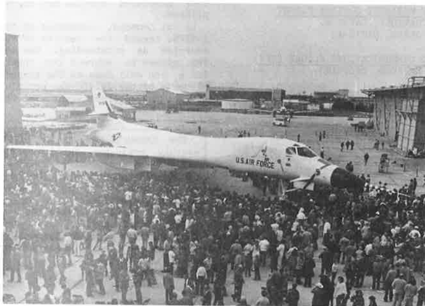
B-1 ROLLOUT--The first prototype B-1 strategic bomber made its debut Oct. 26 at Palmdale, Calif. Many key DoD officials were present at the ceremonies that included a speech by Secretary of Defense James R. Schlesinger.