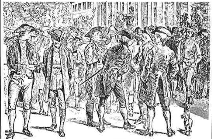
First reading of the Declaration of Independence.

Highlight of the week is Moon Day, July 20, anniversary of man's first landing on the moon in 1969. The flight dream of ages was fulfilled when Astronaut Neil Armstrong set foot on the lunar surface, stating: "That's one small step for a man; one giant leap for mankind."