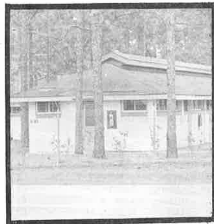
Gulf Coast Concentration