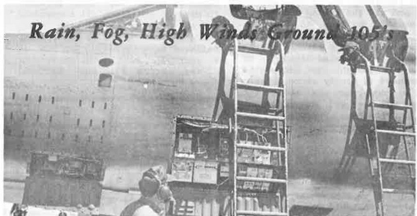
Ground crew prepares aircraft for mission during AFT at Gulfport, MS. Scenes like the above were few as adverse conditions cut flying time.