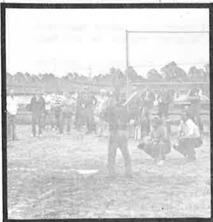
Annual Spring Training