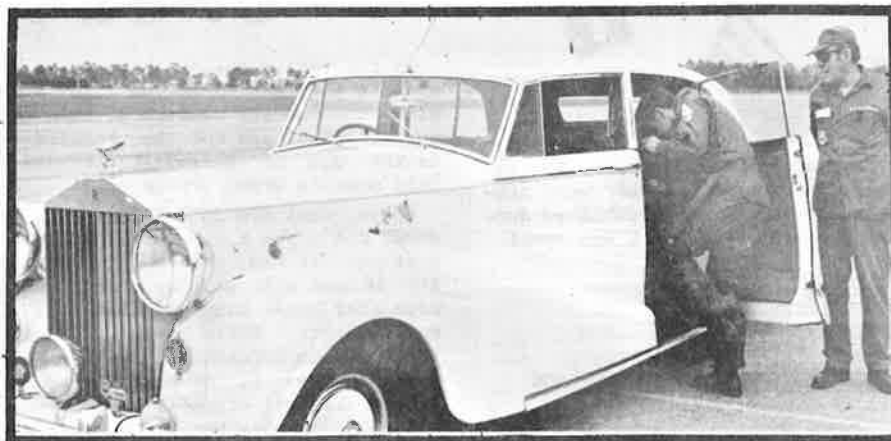
ANG Flight Stimulator