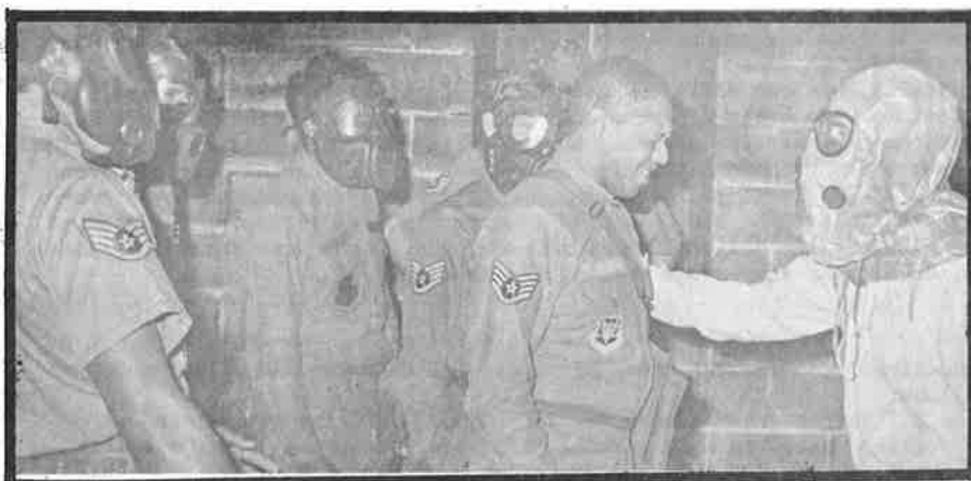
Gas House Gang in 'Cry Me A River'