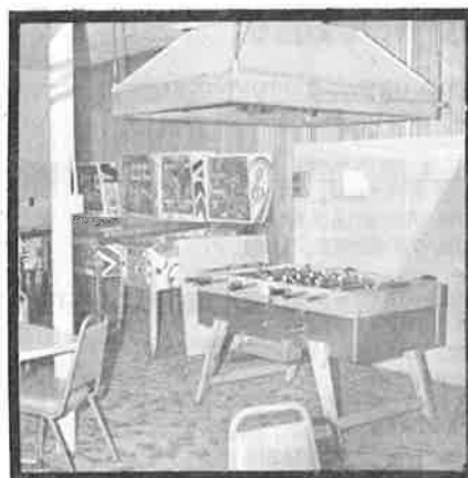
Base Ops (Opps)