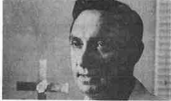
By MAJ XEL SANT'ANNA

Sunday 0830 - General Protestant 1300 - Mormon 1400 - Catholic Mass