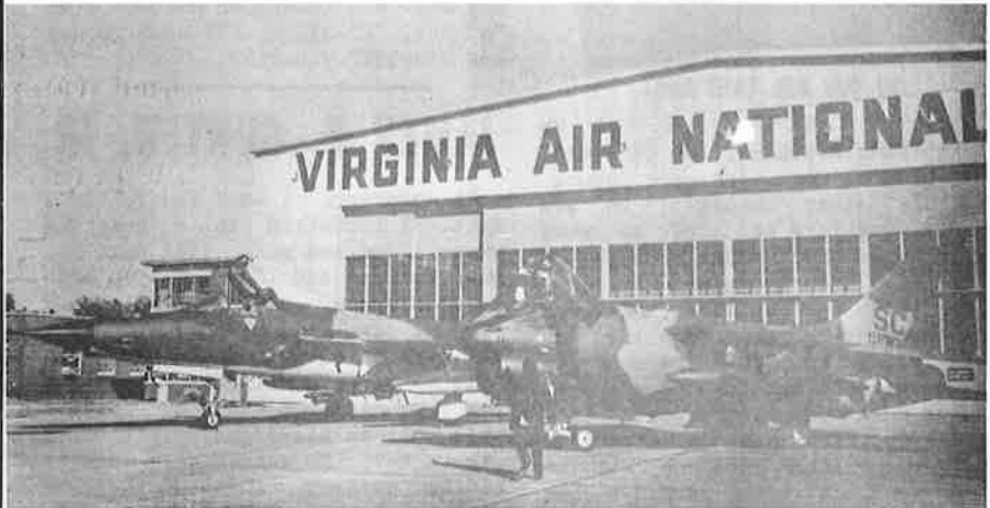
A member of the Virginia Air National Guard's 192nd Tactical Fighter Group checks out what will soon be the "new plane on the block" at Byrd International Airport. The A-7D Corsair II is on the way in and the F-105 Thunderchief on its way out if current plans for the unit's conversion remain firm. The first of 18 A-7Ds is scheduled to arrive at the 192nd in June with the conversion complete by spring of 1982.