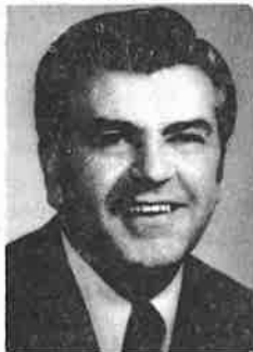
Herbert H. Bateman 1st District Congressman