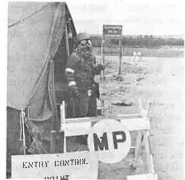
A disaster preparedness exercise during the first week employed all unit personnel to acquaint them with USAFE survival procedures.