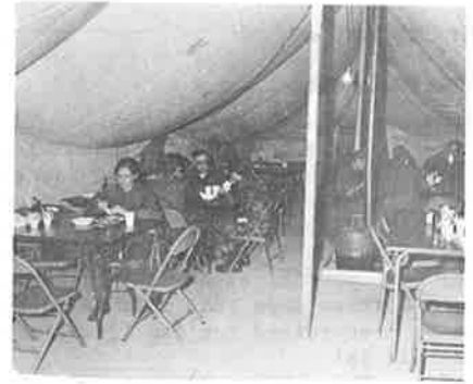
CPT Sally Morger, news correspondent and food critic, samples smoked reindeer tongue and marinated salmon.