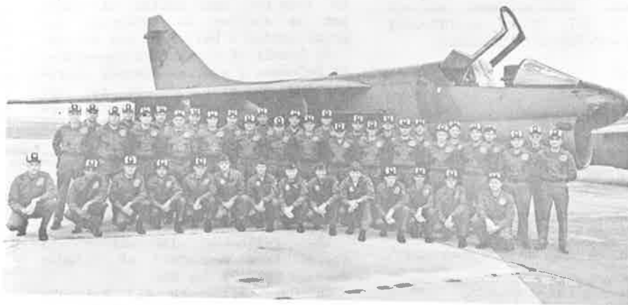
GUNSMOKE '85 team