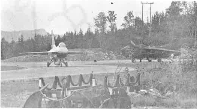
The 192d TFG A-7 and the Norwegian F-16 aircraft flew exercises together during the deployment.