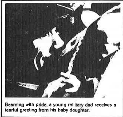
Beaming with pride, a young military dad receives a tearful greeting from his baby daughter.