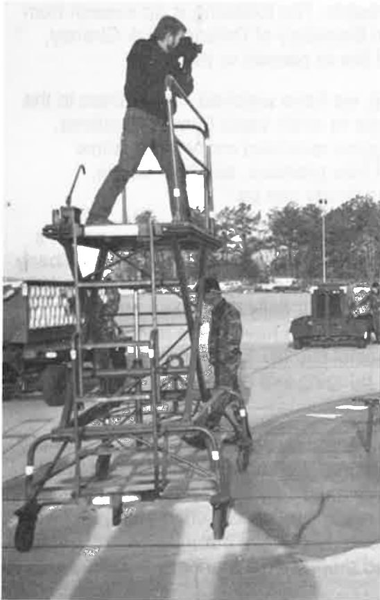
"Acrobatics" were required to capture the essence of the 192d on film.