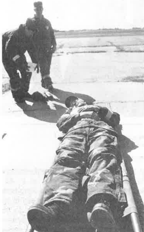
Instead of staying warm indoors, approximately 35 guardsmen from the 192d Tactical Clinic braved the elements March 3-4 to learn more about field medicine. Clinic exercise story on page 3.