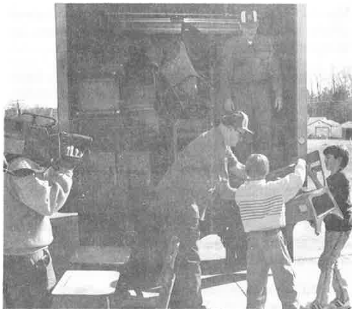
TV cameraman films 192TFG members transferring Hanover County school desks from truck to Panama-bound C-130 cargo plane.