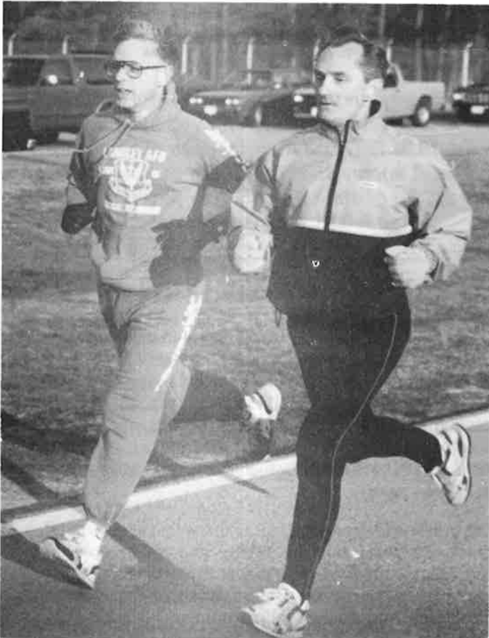
PHOTO AT LEFT: it's that time of year again! Annual physical training evaluations began last month, and will continue through early summer. Time to get in shape and stay in shape!