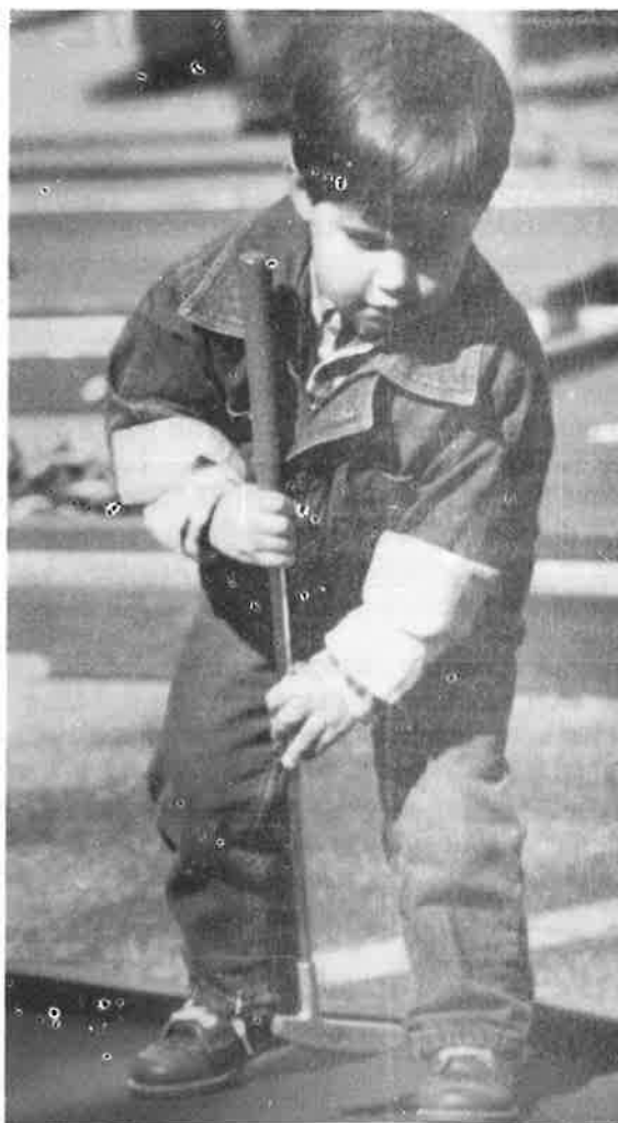
Family Day photos (above and right) reflect the good food and company enjoyed by members of the 192d TFG and their families during April's UTA. A snowy start to the day did not dampen the spirits of children and their parents enjoying the fellowship, fun, and games.

Whenever a gratuity is delivered to you (e.g., left on your desk, front porch, or in your car), if you can return it - do so. If you cannot, turn it over to your supervisor along with the name of the person you believe has given it to you. Play it safe - and - be safe. Whenever you are in doubt, call the contracting office or consult the base legal officer. Thank You - BUT - No Thank You"