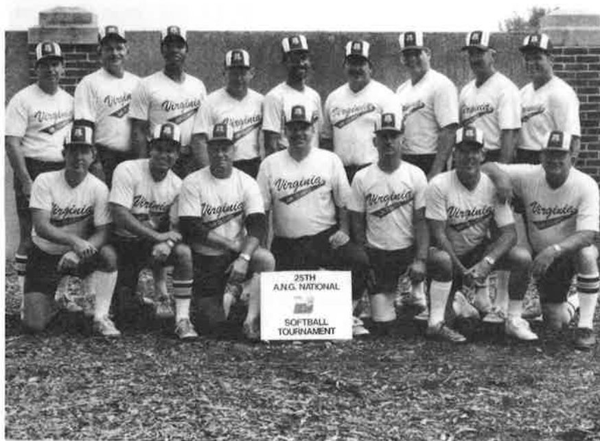
Members playing on the over 35 team this year include:

Well, history can now record that the Virginia Air Guard "Rebels" did themselves proud at the 1990 nationals in York, Pennsylvania. The team finished second in its division, and they accomplished this feat in a similar fashion to '84 - winning the first game, losing the second, scrambling back through the loser's bracket, and then winning the next six games in a row (on the same day)! Outstanding ball! Congratulations!