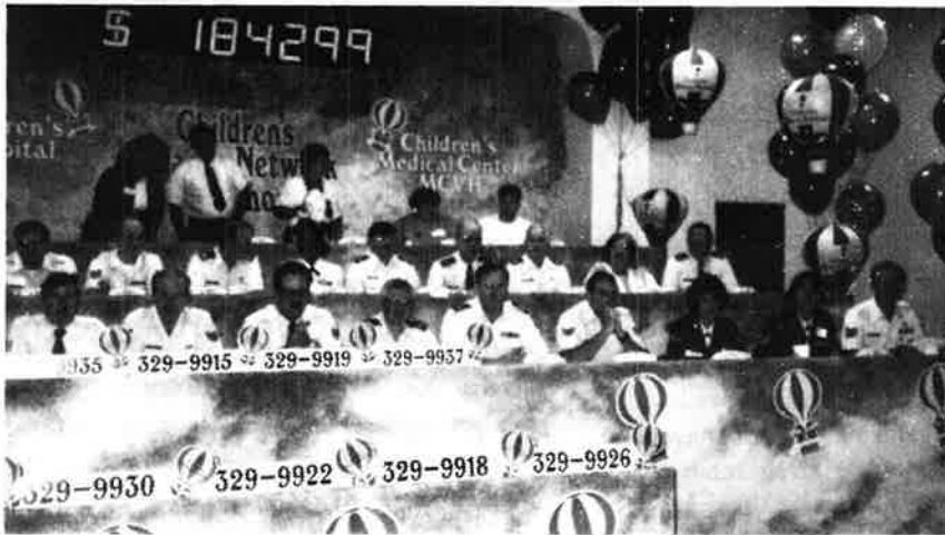
Members of the 192d TFG pull the "early shift" at Channel 12 studios during the recent Children's Miracle Network Telethon and Carnival (story on page 2).