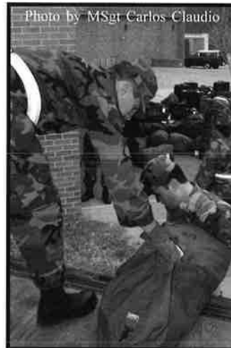
Airmen from the 192d FW work together to load a truck with deployment bags during Jan ORE.