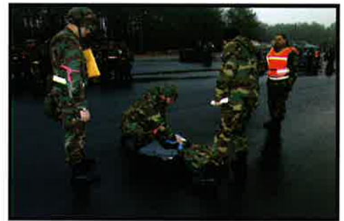
A member of the 192d Fighter Wing is randomly chosen to match his packed items to his required list during luggage inspection.