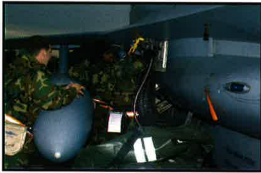
192d Fighter Wing flightline personnel load munitions into an F-16C during January's ORE.